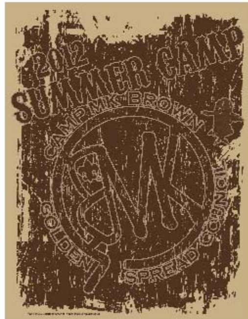
T-shirt color: Desert Sand

To order, go to . . . http://www.goldenspread.org/